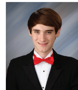
Hunter Roch Mathas Scholarship