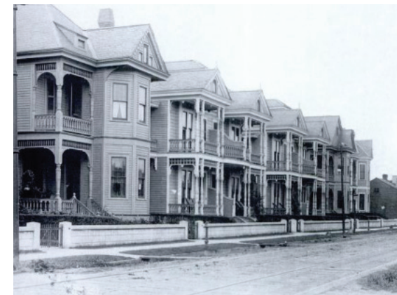
Fabacher's Row - photo of the 4100 block circa 1898